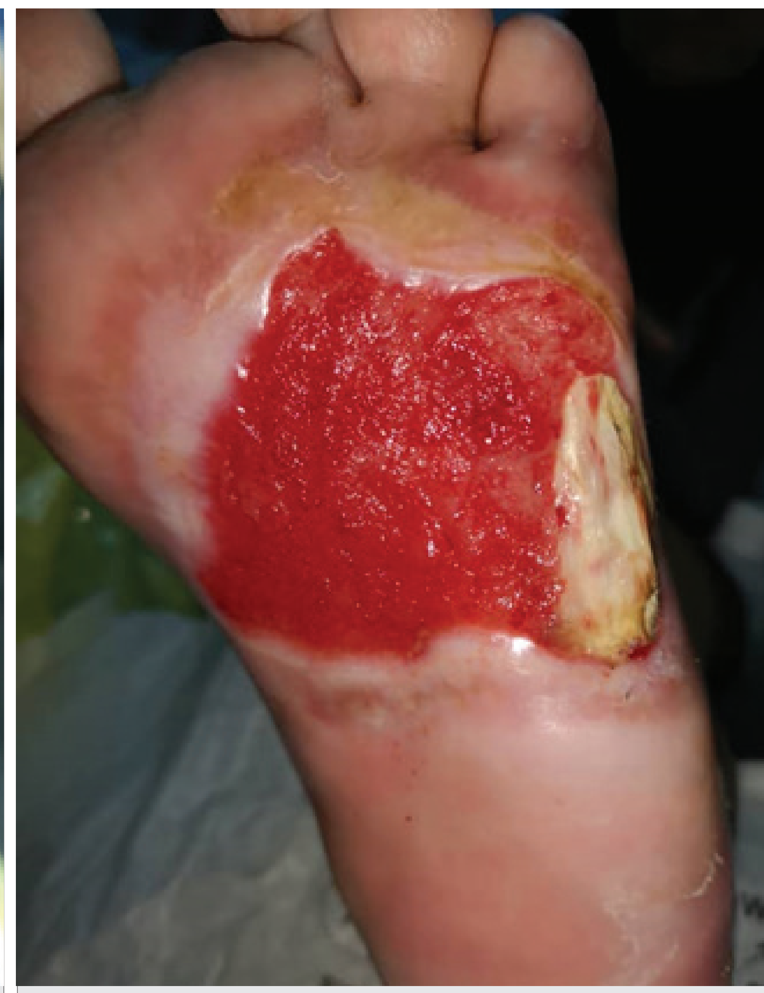
28/3/2019 Wound measurement was: L:6cm, W:7, D:0cm, there was presence of healthy granulation tissue with no sign of infection, no foul smelling odour, wound is moist with advancing edges.