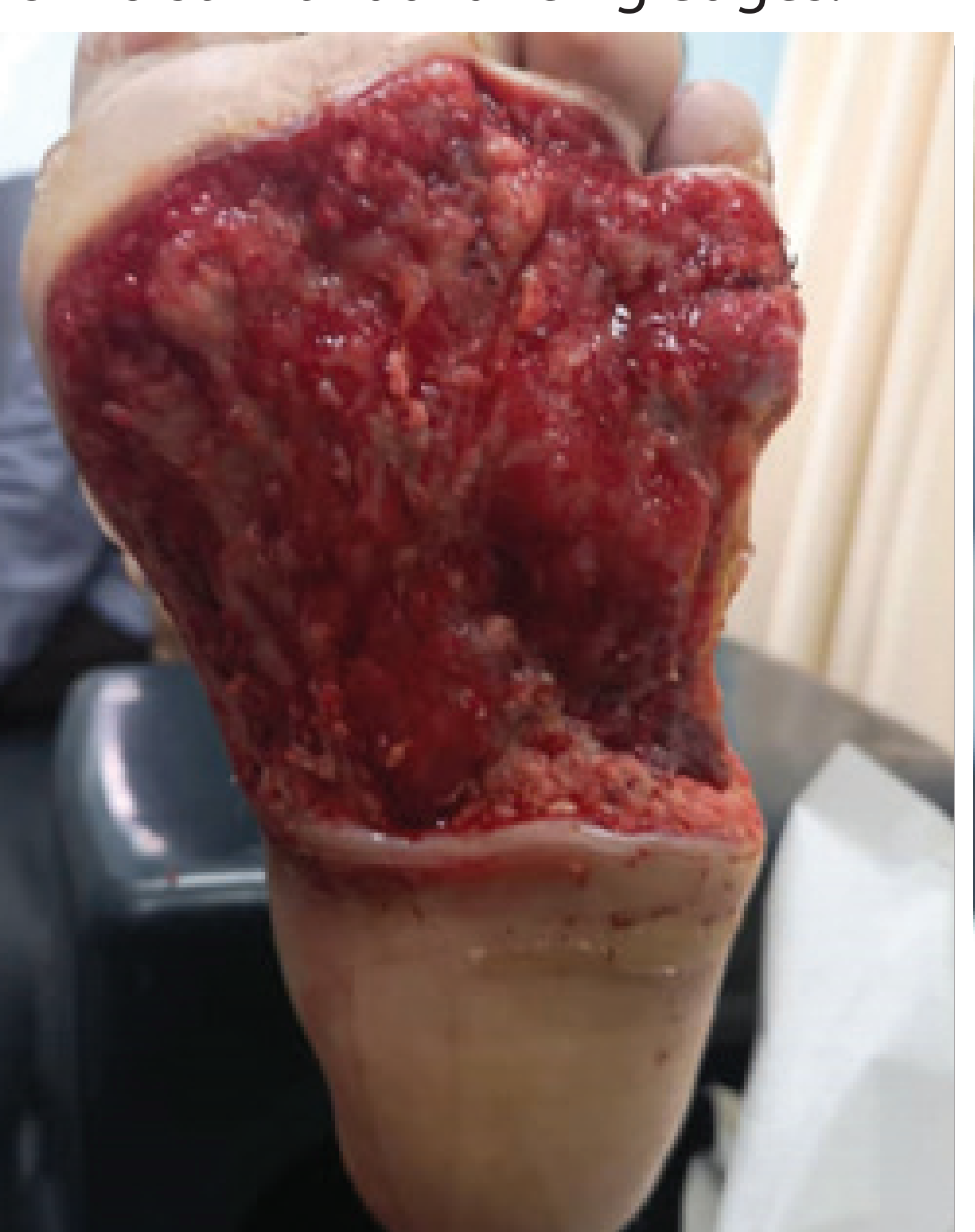
21/01/2019 Presence of less than 15% slough/necrotic tissue, and >85% of granulation tissue, tendon was exposed. There was minimal foul smelling odour with no obvious sign of infection. Exudate was minimal, with non-advancing macerated edges.