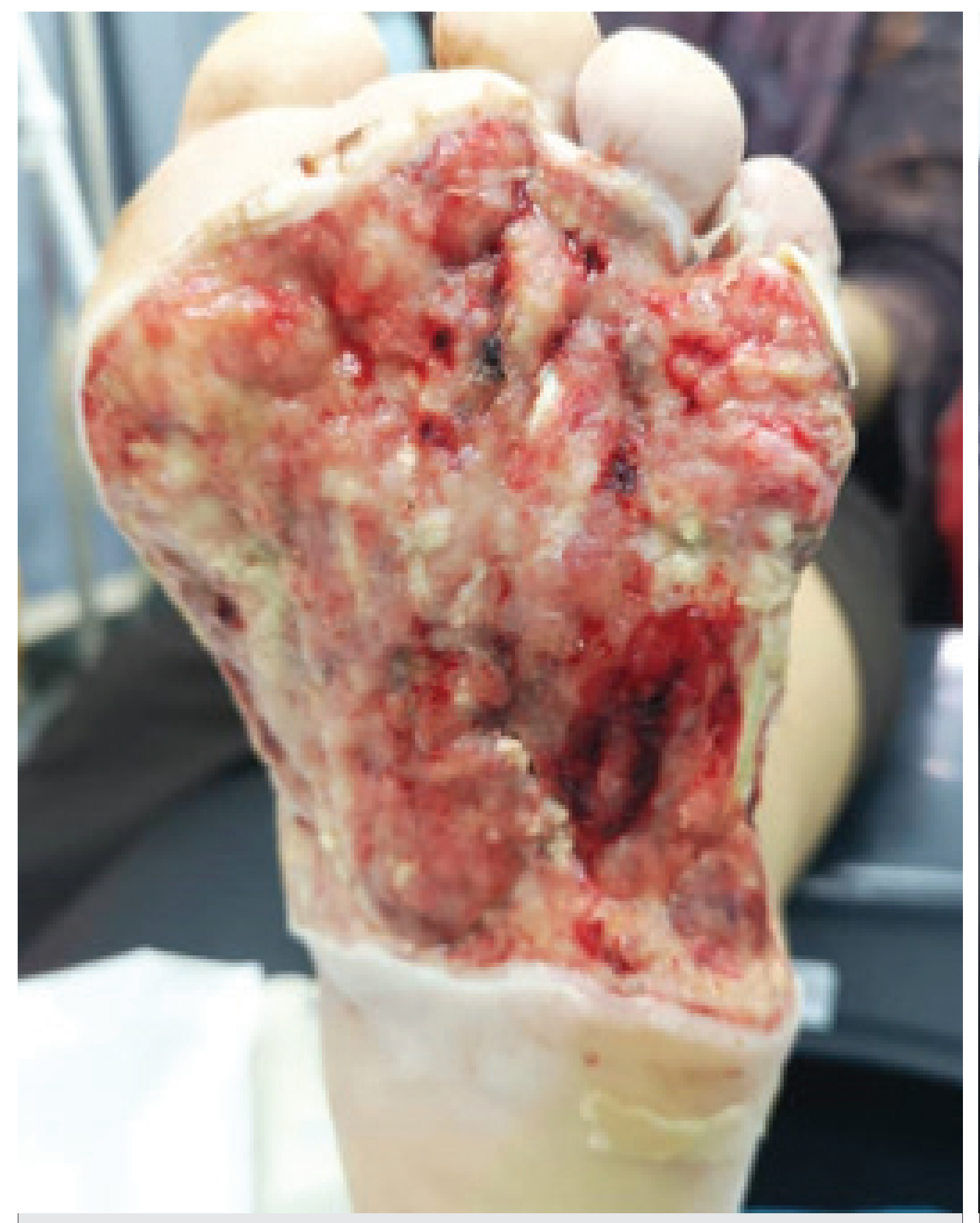
15/01/2019 (BASELINE) Wound measurement was: L: 17cm, W: 9cm, D: 1cm, there was more than 75% slough and necrotic tissue, with less than 25% of granulation tissue seen, tendon was exposed as well. There was presence of heavy yellowish discharge with foul smelling odour, wound edges were non-advancing and macerated.

After 10 weeks (28/3/2019), Wound measurement was: L:6cm, W: 7, D:0cm, there was presence of healthy granulation tissue with no sign of infection, no foul smelling, wound is moist with advancing edges.